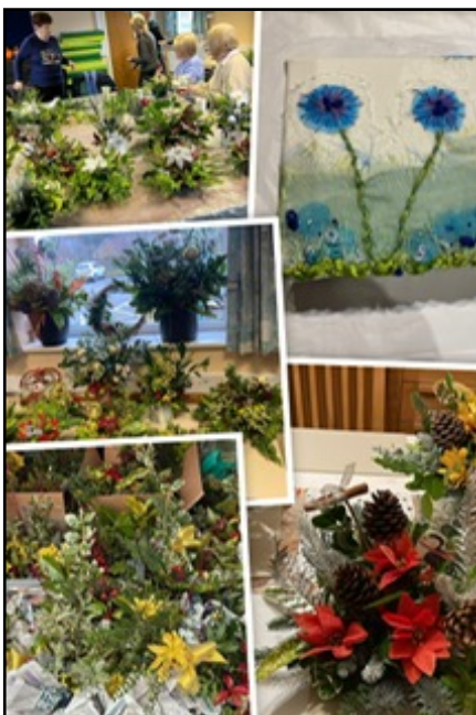
Table decorations were designed and made to decorate our Christmas party tables.